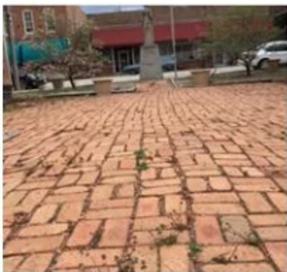
The park as it looks today ...