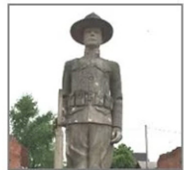
The Doughboy statue in the current park

Send your donation to: Veterans' Park Fund Village of Elkhart PO Box 20 Elkhart, IL 62634